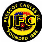
PRESCOT CABLES JUNIOR FOOTBALL CLUB